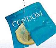
Condoms & their wrappers