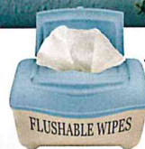
Baby & facial wipes

Improper disposal of Fats, Oils, and Grease (F.O.G.) is also a major cause of sewer backups in our community. Pouring F.O.G. down your drain may cause costly backups in the sewer system and your home. Dry wipe dishes and cookware with a paper towel before washing them and dispose of F.O.G. in the trash.