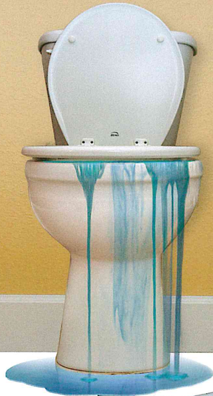
Cotton swabs & makeup pads

AVOID SEWER BACKUPS BY KEEPING THIS STUFF OUT OF YOUR TOILET: