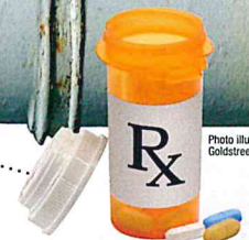
Prescription and OTC medications

! Unused prescription drugs and over-the-counter medicines should be dropped off at designated locations. Contact your local hospital, solid waste management district or pharmacy for disposal options.